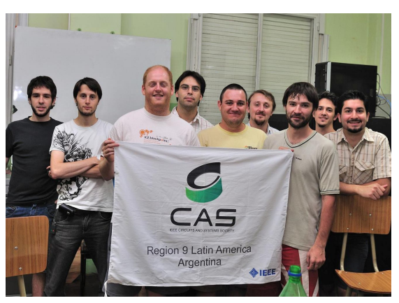
On the picture, some graduated Students Member attending the STEP performed in Bahía Blanca, Argentina.