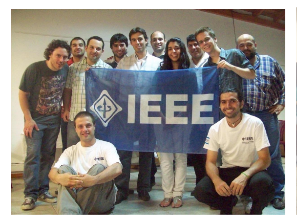
Some students and GOLD members attending the STEP performed in Córdoba, Argentina.