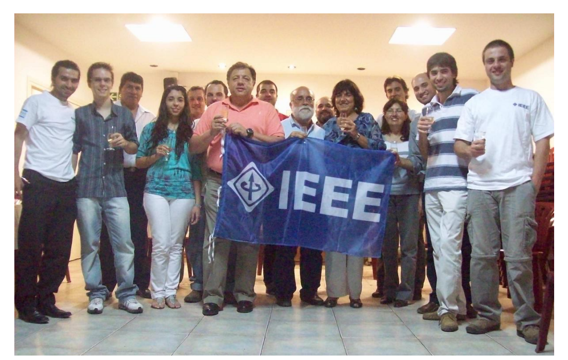
On the picture, Argentina Section and Cordoba Subsections officers, GOLD members and students members attended the GOLD STEP celebrate at Cordoba, accompanied by authorities of Engineers College, where the event was developed.