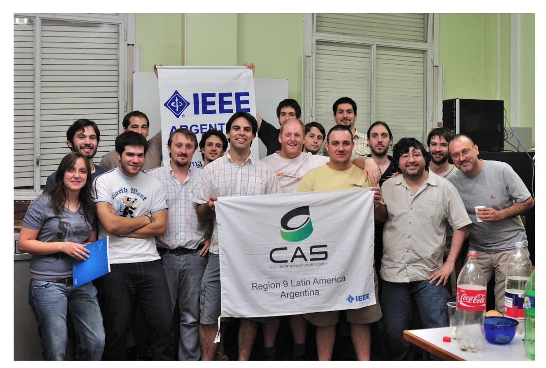
On the picture, GOLD and students member attended the GOLD STEP celebrates at Bahía Blanca, Buenos Aires, Argentina.