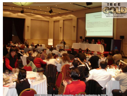
Fig. – Attendees at TISP Workshop organized by EAB in Argentina.