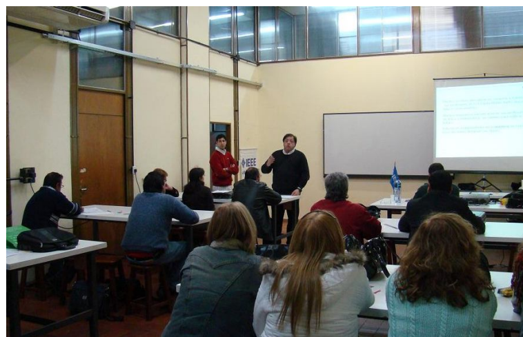
Fig. – Second Workshop TISP development in Argentina Section.