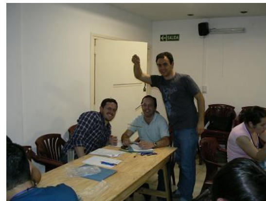
Fig. TISP Workshop developed in Student Branch National Meeting 2009.