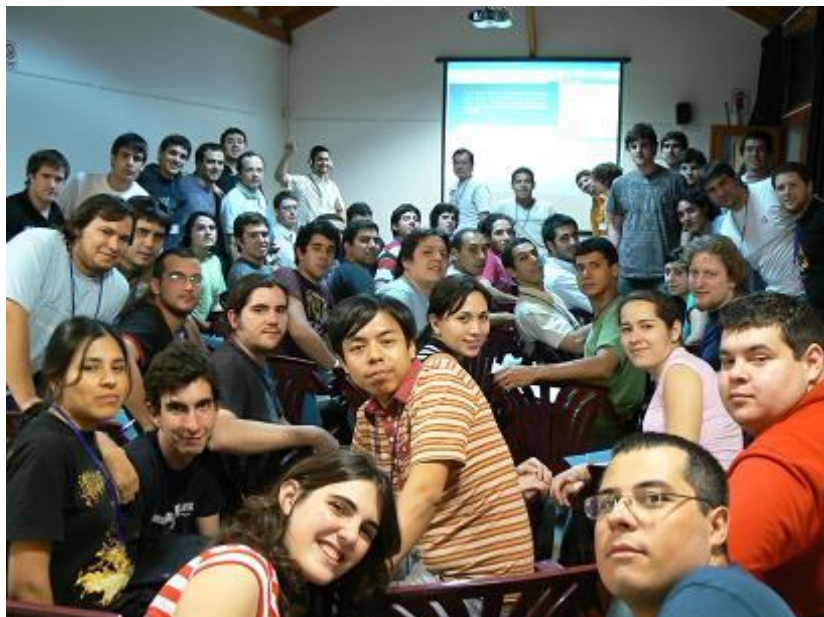
Fig. Attendees at Student Branch National Meeting 2009, who participated in TISP Workshop.