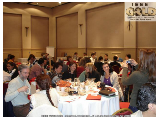
Fig. – TISP Workshop organized by EAB in Argentina.