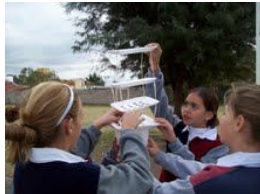
Fig. TISP Workshop Mark Twain School, development in Primary Level.