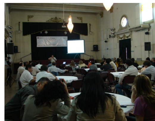
Fig. –Attendees at fourth TISP Workshop made in Argentina with teachers.