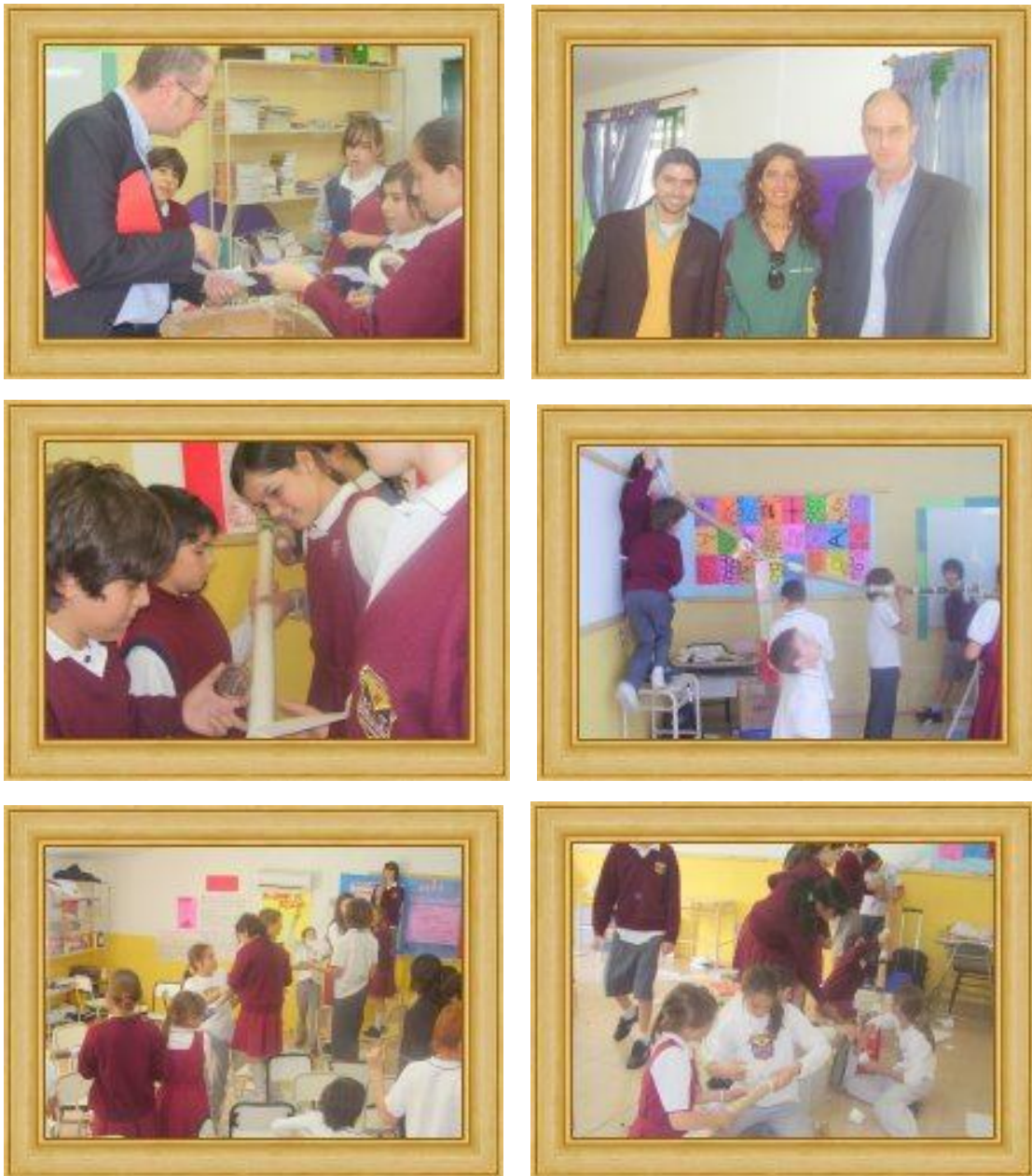
Fig. – First TISP Workshop developed in Argentina in Primary School level.