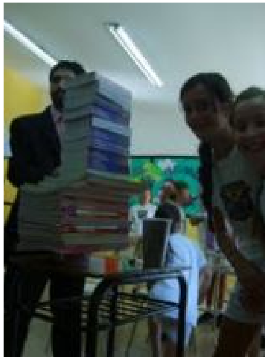
Fig. – Second visit to Mark Twain School, where the TISP was conducted.