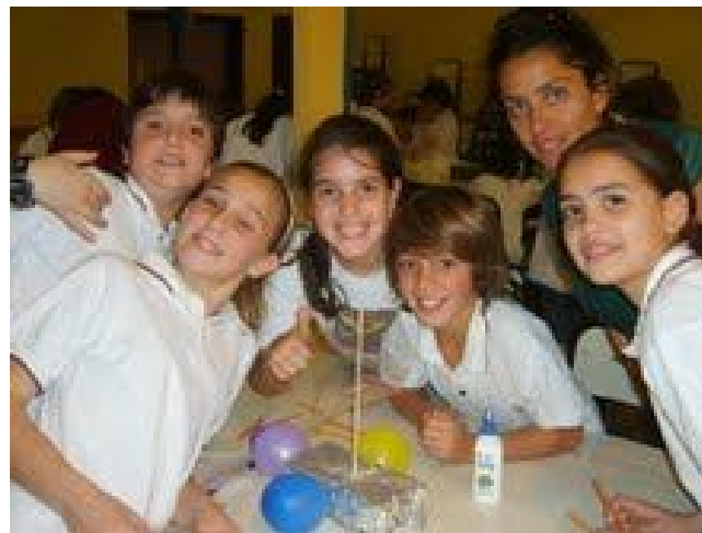
Fig. TISP Workshop in Primary School Level conducted in August.