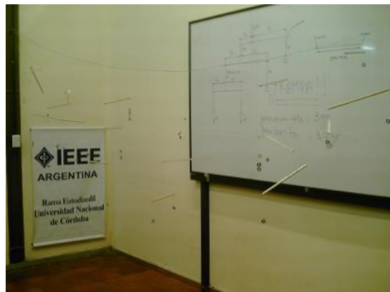
Fig. – Teachers working in activity and their work carried out and completed.