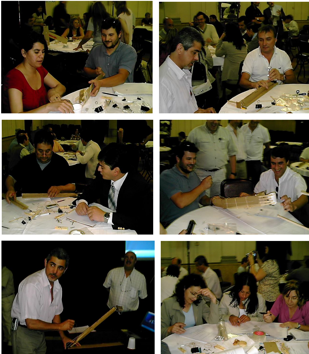
Fig. – Fourth TISP Workshop conducted in Argentina with teachers.

http://www.noticieero.org/wp-content/uploads/2008/NoticIEEEero_60.pdf